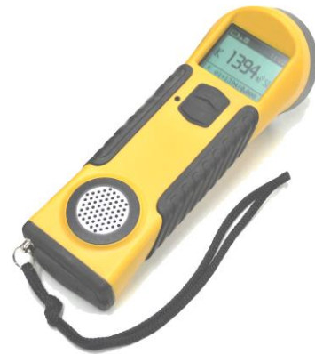
KT-10 v2 Magnetic Susceptibility Meter (Circular Coil)