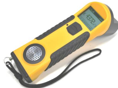
KT-10R v2 (Rectangular Coil)