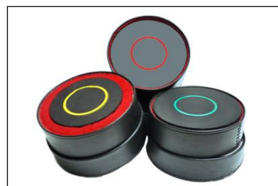
Conductivity Reference Pads