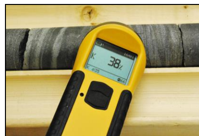
KT-10 Plus v2