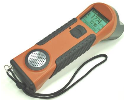
KT-10R S/C Magnetic Susceptibility/Conductivity Meter (Rectangular Coil)