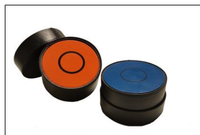
Magnetic Susceptibility Calibration Pads