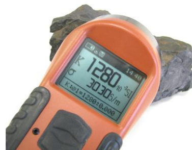
KT-10 S/C (Circular Coil)