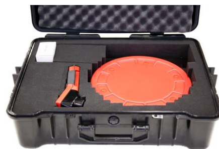
3F-32 Transportation Case