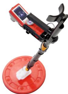
3F-32 Sensor Assembled

Specifications are subject to change without notice (April 1, 2019)