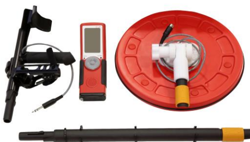
3F-32 Sensor with Telescopic Pole, Control Handle and KT-20 Console