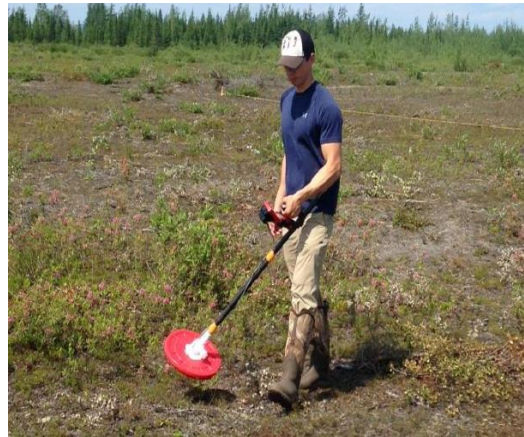
3F-32 Sensor for Soil Mapping

Due to the ability for the KT-20 3F-32 to collect more data, users can create highly precise contour maps using mapping software programs, such as Surfer. External GPS units can be interfaced with KT-20 3F-32 to improve GPS accuracy.