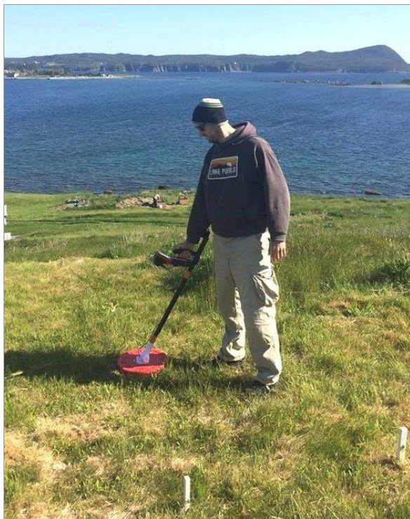
3F-32 Sensor During an Archaeology Investigation in Newfoundland

The KT-20 with 3F-32 sensor is an ideal instrument for field research. It can take a single measurement at a specific location, or continuously collect data to map an entire area. A GPS receiver is integrated into the KT-20 console to provide location coordinates with the data. It also has a built-in high resolution digital camera to visually document any sample of interest. Data from the KT-20 can be exported into third-party mapping software programs.