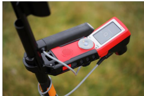
KT-20 Console with 3F-32 Sensor