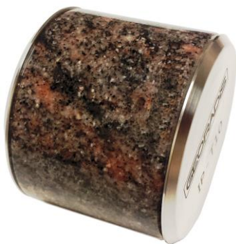
IP-T10 Reference Pad