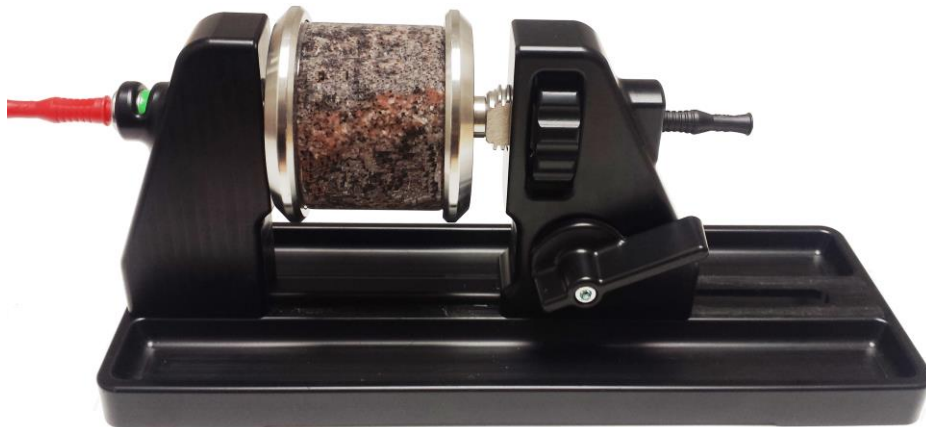
IP-10 Reference Pad with Sample Holder