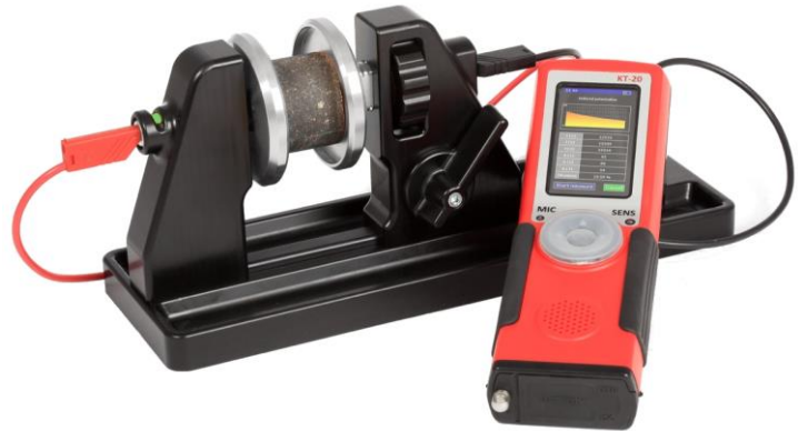
KT-20 Console with IP/Resistivity Sensor (includes Tx-Rx Electronics) and Sample Holder

The IP-T10 reference pad is available as an option for users who wish to verify or re-calibrate their KT-20 IP.